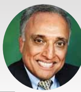
P. CHIDAMBARAM Former Finance Minister

From what we have seen so far, there appears to be no substantial relief for the telecom sector. Of course, we are waiting to see the details. The FM has talked about smart meters and Artificial Intelligence, and we will see how that translates into benefit for our sector"