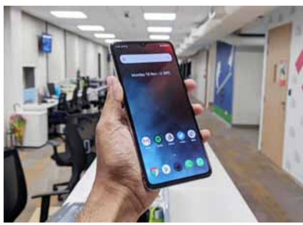
"Realme 5G handset will be powered with 865 Snapdragon chipset and available at around Rs. 50,000"

Many tech companies have been eyeing the kick-start of 5G networks in India, so as to begin with the deluge of the launches of their respective 5G offerings. It makes sense though - luring consumers with something that does