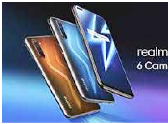
"Both Realme 6 and Realme 6 Pro have been manufactured in India based on our customer's feedback"

Realme also unveiled its smart band in India with features like 2.4cm large colour display, real-time heart rate monitor, USB direct charge, smart notifications, intelligent sports tracker personalised dial face, sleep quality monitor