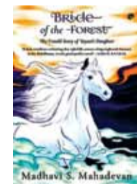
Bride of the Forest: The Untold Story of Yayati's Daughter By Madhavi Mahadevan; Speaking Tiger; 336 pages; Rs499

About the book's subtitle - "The Untold Story of Yayati's Daughter" - the author says: "Here 'untold' is the operative word, implying not only a first