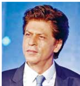
"Adipurush" has also been put on hold. Approximately,

Rs100-150 crore is at stake as besides these films shot, there were numerous other films at various stages of production — where sets were being constructed or other stages of pre-production or shooting.