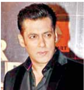
being shot in the state. According to reports,

Cinema halls have been shut, and the Maharashtra government has ordered all film and TV shoots to be stopped immediately. This has come as a huge impediment to Bollywood as many big-ticket films including Shah Rukh Khan's "Pathan", the Ranveer Singh-starrer "Cirkus", and Ajay Devgn's "Mayday" and "Maidaan" were currently