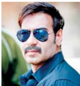
Salman Khan's "Tiger 3" and the Prabhas-starrer