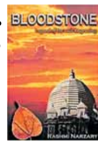
BLOODSTONE: Legend of the Last Engraving By Rashmi Narzary, 198 pages; Rs 1,821

The story projects the power of the female, the strengthening of the subdued and the sheer capacity of a mother’s love and I have highlighted this against the backdrop of the temple’s famed annual ritual celebrated as the festival of fertility and creation—the Ambubachi Mela such a huge influence, not only on me but people across the region and beyond,” the Sahitya Akademi award winner for Children’s Literature said. In the underground sanctum sanctorum of the four-chambered