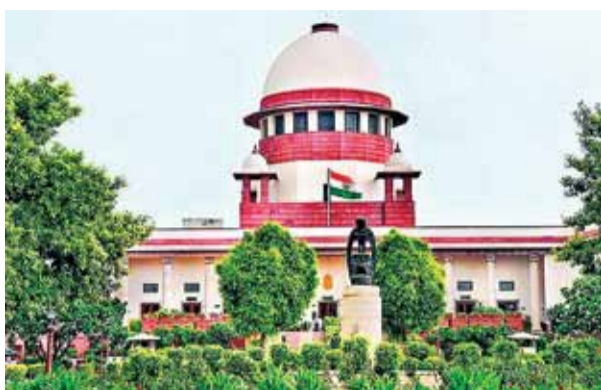
DECLARE RESULTS BY JULY 31: SC

NEW DELHI: The Supreme Court on Thursday directed all the state boards to declare results of internal assessment of Class 12 examination by July 31, making it clear that each board is free to formulate its own evaluation method for students and there can't be a "fit-all" scheme. The top court, which said it would not pass any direction for a uniform assessment scheme across the country for students whose board exams have been cancelled amid the COVID-19 pandemic, directed the state boards to ensure that schemes are formulated and notified at the earliest and not later than 10 days from Thursday.