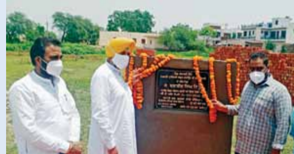
Health and Family Welfare and Labor Minister Balbir Singh Sidhu laying the foundation stone of Government Primary School at village Sambhalki.