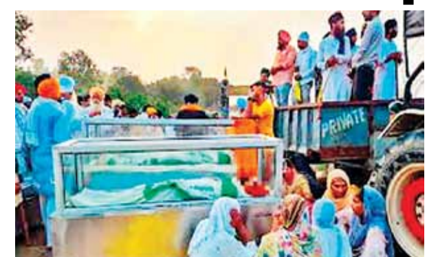
FW BUREAU Chandigarh

Politics have heated up in poll-bound Uttar Pradesh after Ashish Mishra 'Monu', son of the Union Minister of State (Home) Ajay Mishra 'Teni' was granted bail by the Lucknow Bench of the Allahabad High Court on Thursday. Ashish has been accused of killing four farmers in Lakhimpur Kheri. The order invoked controversies in political circles during the ongoing election process in the state, where the ruling BJP is seeking a second term for the power.