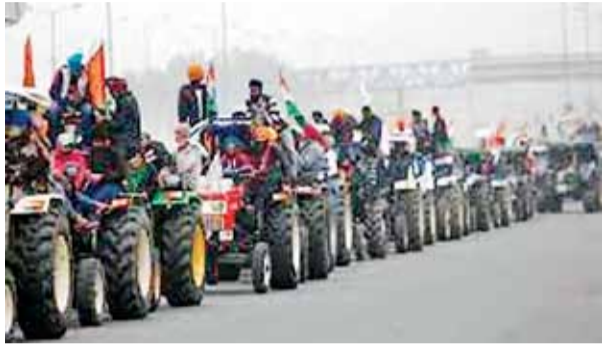
ment in a "massive way" all over India. "From November 29 until the end of the winter session, 500 selected farmer