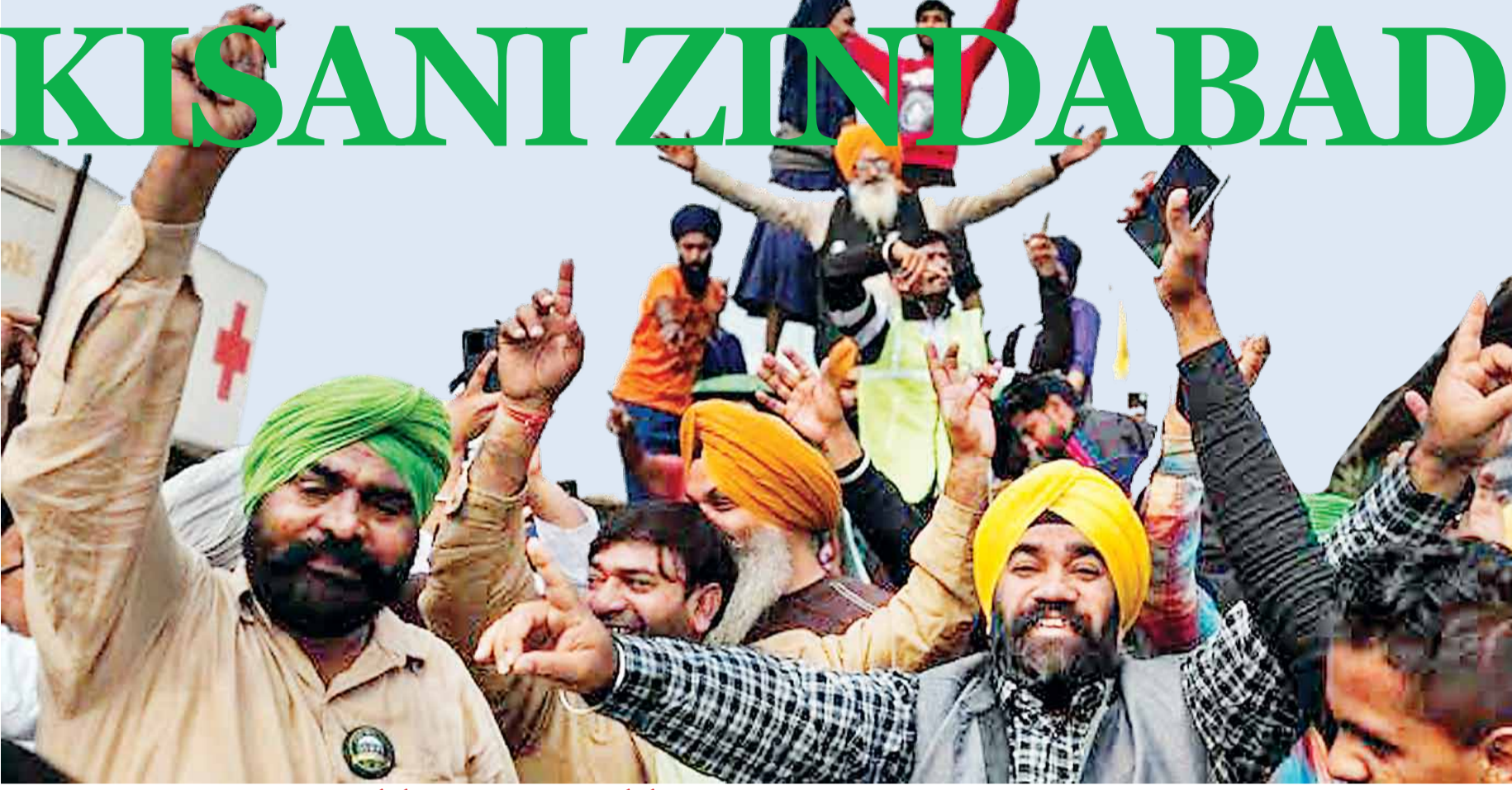
CHHAVI BHATIA New Delhi

TAYLOR SWIFT PERFORMS 'ALL TOO WELL' ON 'SATURDAY NIGHT LIVE'