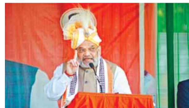
Aribam Bishwajit Imphal

Propelling the BJP's campaign for the second phase of the Manipur Legislative Assembly election, Union Home Minister Amit Shah criticized the Congress party, saying that Ibobi Singh-led government could only provide tap water connection to only 5% households.