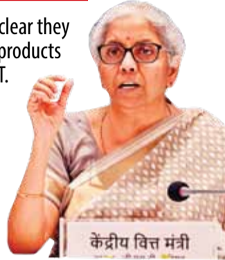
NIRMALA SITHARAMAN Finance Minister

“Members made it clear they do not want petroleum products to be included under GST. It was decided, we will report to Kerala High Court that, matter has been discussed and the Council felt it was not the time to bring petroleum products under GST.”