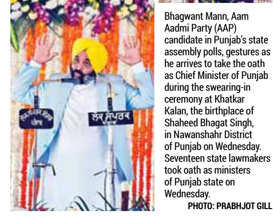
Bhagwant Mann, Aam Aadmi Party (AAP) candidate in Punjab's state assembly polls, gestures as he arrives to take the oath as Chief Minister of Punjab during the swearing-in ceremony at Khatkar Kalan, the birthplace of Shaheed Bhagat Singh, in Nawanshahr District of Punjab on Wednesday. Seventeen state lawmakers took oath as ministers of Punjab state on Wednesday.