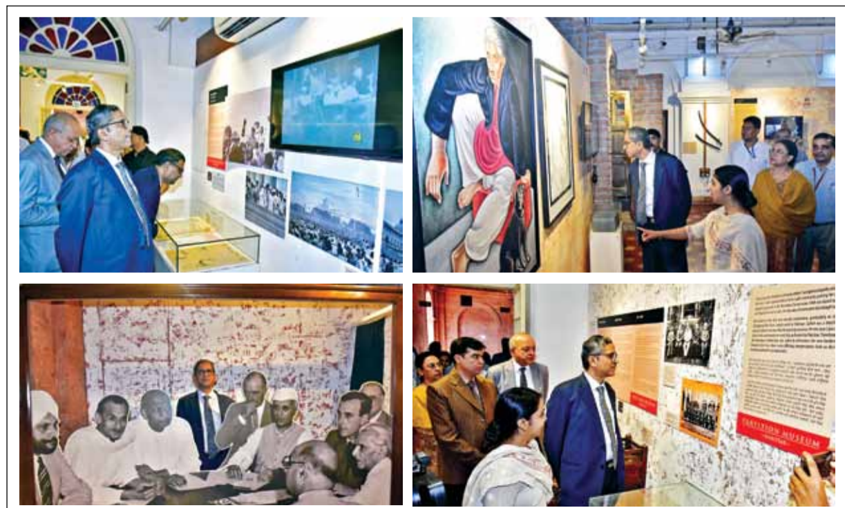
Chief Justice of India N. V. Ramana visits the Partition Museum in Amritsar on 14th April.

Family members of martyrs of the Jallianwala Bagh Massacre pay their tribute on the 103rd anniversary of the Jallianwala Bagh massacre at the memorial in Amritsar on Wednesday. The Amritsar massacre, also known as the Jallianwala Bagh massacre, where on April 13, 1919, British Indian Army soldiers opened fire on an unarmed gathering, killed at least 379 men, women and children according to official records.