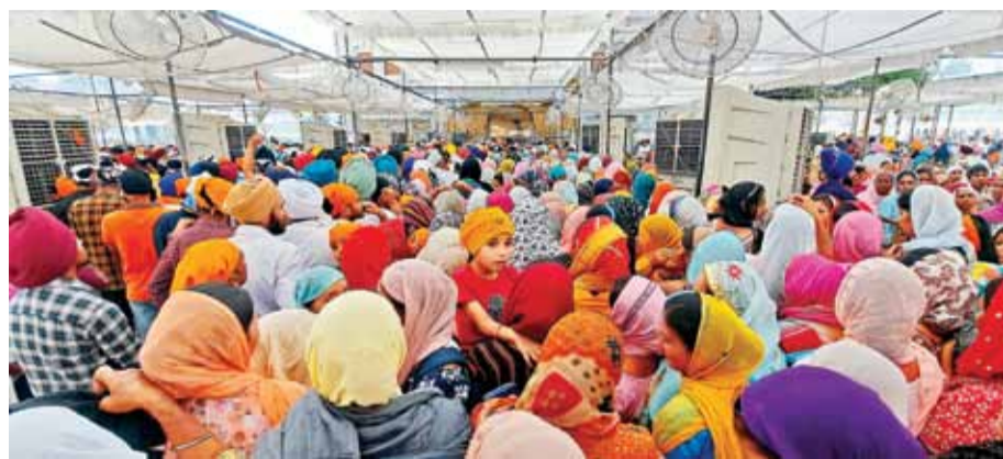
Sikh devotees pay respects on the occasion of Vaisakhi at Sri Harmandir Sahib in on Thursday. Vaisakhi celebrate as a harvest festival and Khalsa Saajna Diwas (Foundation Day-1699)