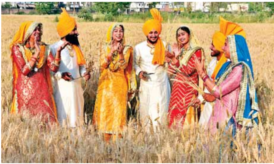
Youths perform the traditional Punjab folk dance "Bhangra" at a wheat field on the outskirts of Amritsar on festival of harvest of Vaisakhi.