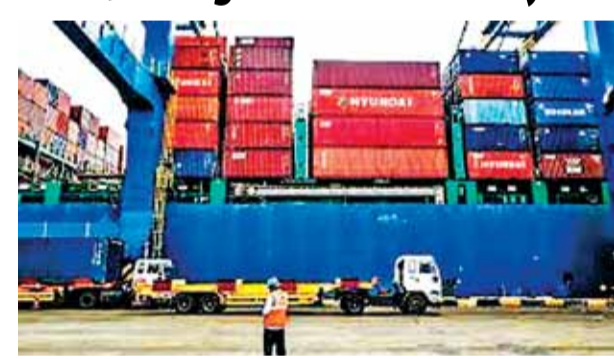
India's overall exports (Merchandise and Services combined) in April 2022* are estimated to be USD 67.79 Billion, exhibiting a positive growth of 38.90 per cent over the same period last year. the same period last year. Overall imports in April 2022* are estimated to be USD 75.87 Billion, exhibiting a positive growth of 36.31 per cent over the same period last year.

After a record performance in the last financial year, the exports continued robust growth in April, 2022 with merchandise exports scaling a new high by crossing USD 40 bn. This is an increase by over 30% vis-à-vis April 2021. Petroleum products (127.69%), Electronic goods (71.69%), cereals (60.83%), coffee (59.38%), processed food (38.82%) and leather product (36.68%) exports led the way in achieving the record performance. Services performed extremely well to reach USD 27.60 bn, which is an increase of 53% over April 2021.