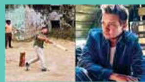
places across this planet!" he captioned the photograph. It is currently unclear if Renner is in the country on a personal tour or professional visit. It is also unknown if this is his first visit to India. The actor, who has played one of the six original Avengers in the MCU, was

The 51-year-old actor shared the picture on his Instagram account on Tuesday. "What a blessing of life to discover, learn and be inspired by people and