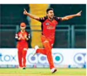
fourth highest wicket-taker in the tournament.

Playing for the Sunrisers Hyderabad in IPL-15, the fast bowler from Jammu has been impressive with his pace and consistently clocked above 150 kmph in the speed gun. He has so far taken 21 wickets, with best figures of 5/25 and is the