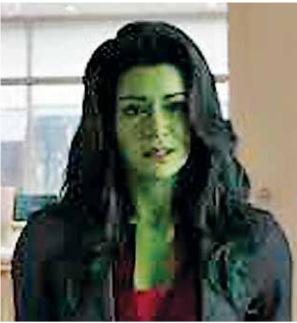
Comedy series "She-Hulk: Attorney at Law" will start streaming on Disney Plus from August 17.

According to Deadline, Marvel Studios president Kevin Feige made the announcement at the Disney's Upfront event on Tuesday.