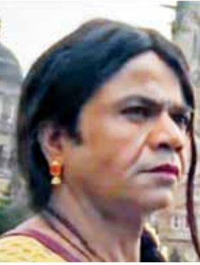
Bollywood actor Rajpal Yadav will be soon seen in the web film 'Ardh' where he will play a small-town guy named Shiva who struggles to become an actor despite being a thespian. The trailer of the film was released on Wednesday. The story is set in Mumbai. To survive in the city of dreams and to earn his bread and butter, he

pretends to be a transgender called Parvati with the support of his wife.