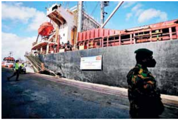
inflation. India on May 23 delivered around 40,000 metric tonnes of petrol to Sri Lanka. "Powering #SriLanka !!!! A

India extended an additional USD 500 million credit line to Sri Lanka last month to help the neighbouring country import fuel as it has been struggling to pay for imports after its foreign exchange reserves plummeted sharply in recent times, causing a devaluation of its currency and spiralling