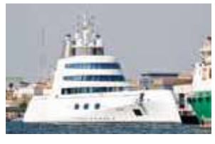
shows the UAE's neutrality during Russia's war on Ukraine as the Gulf country remains a magnet for Russian money and its oil-rich capital sees Moscow as a crucial OPEC partner. Since Russian tanks rolled

The display of lavish wealth is startling in one of the UAE's poorest emirates, a 90-minute drive from the illuminated high-rises of Dubai. But the 118-metre Motor Yacht A's presence in a Ras al-Khaimah creek also