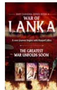
War of Lanka By Amish Tripathi HarperCollins