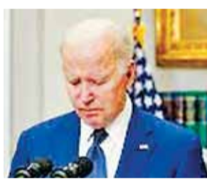
On May 17, he was in Buffalo, New York, to meet with victims' families and condemn white

The visit to Uvalde on Sunday is Biden's second trip in as many weeks to comfort a community in mourning after staggering loss.