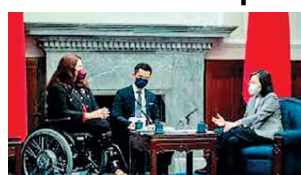
systems on alert and issuing radio warnings. In her remarks to Tsai, Duckworth said she wanted to emphasize our support for Taiwan security. I do want to say that it is more than just about military. It's also

China claims Taiwan as its own territory to be annexed by force, and sent 30 military aircraft into airspace close to the island Monday. Taiwan's Defense Ministry said it responded by scrambling jets, putting air defense missile