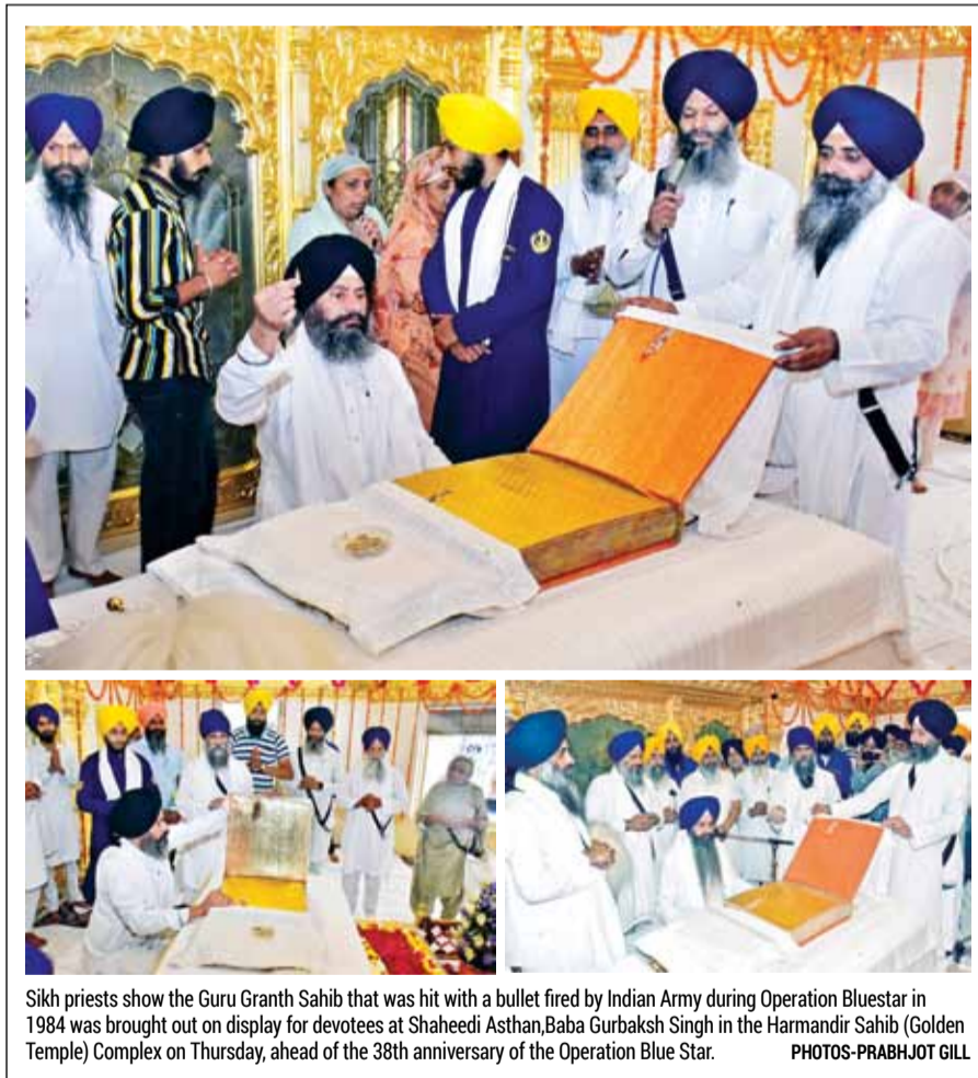
Sikh priests show the Guru Granth Sahib that was hit with a bullet fired by Indian Army during Operation Blue Star in 1984 was brought out on display for devotees at Shaheedee Asthan, Baba Gurbaksh Singh in the Harmandir Sahib (Golden Temple) Complex on Thursday, ahead of the 38th anniversary of the Operation Blue Star.

In the other matches of the day, Vachier-Lagrave defeated Norwegian Aryan Tari and Anish Giri shared points with So, drawing the classical and Armageddon games while Shakhriyar Mamedyarov topped Topalov in the sudden death. In the ongoing Norway Chess tournament, the players take part in a Armageddon (sudden death) in case of a draw in the classical game. American star So had won the Blitz event which preceded the Classical section.