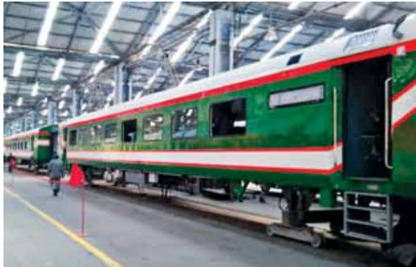
tracks to broad gauge and the LHB coaches from ICF would be of great help in modernising Bangladesh Railways. He said Bangladesh Railways