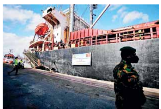
inflation. India on May 23 delivered around 40,000 metric "Powering #SriLanka!!!! A