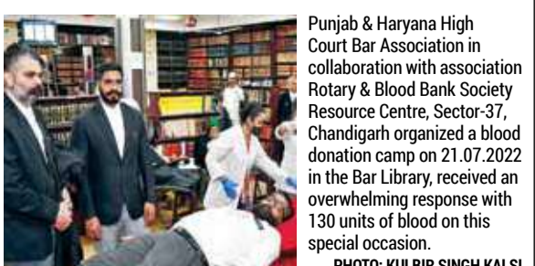
Punjab & Haryana High Court Bar Association in collaboration with association Rotary & Blood Bank Society Resource Centre, Sector-37, Chandigarh organized a blood donation camp on 21.07.2022 in the Bar Library, received an overwhelming response with 130 units of blood on this special occasion.