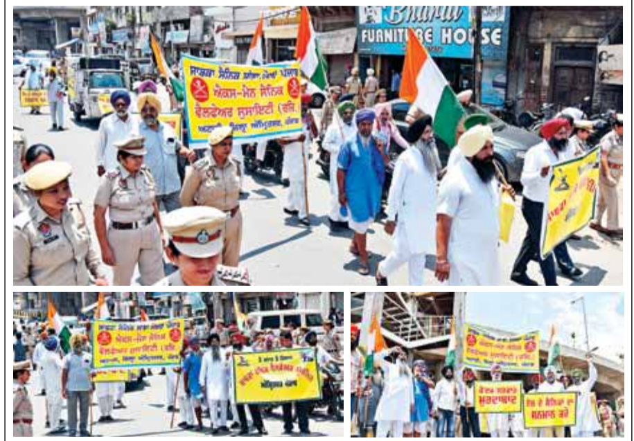
Indian Army ex-serviceman hold placards and shout slogans as they take part during their protest amid 'Bharat Bandh', called to protest against the Centre's 'Agnipath' scheme, in Amritsar on 20 th June-2022.