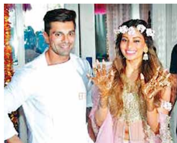
Thank you all, for your unconditional love, your prayers and good wishes as they are and will always be a part of us

Bollywood couple Bipasha Basu and Karan Singh Grover on Tuesday said they are soon set to welcome their first child. Basu, 43, and Grover, 40, made the announcement on their official social media pages amid reports of pregnancy. "A new time, a new phase, a new light adds another unique shade to our prism of life. Making us a little more whole than we used to be. "We began this life individually and then we met each other and from then we were two. Too much love for only two, seemed a little unfair for us to see...so soon, we who once were two will now become three," they said in a joint statement along with the pictures of Basu showing off her baby bump. The couple, who first worked together on the 2015 film "Alone", tied the knot in 2016. They have also co-starred in the 2020 web series "Dangerous". Basu and Grover said the baby will arrive soon. "Thank you all, for your unconditional love, your prayers and good wishes as they are and will always be a part of us. Thank you for being a part of our lives and manifesting with us another beautiful life, our baby," they further said.