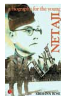
Netaji Krishna Bose Rupa 72 pages; Rs 95

Aiming to bring an end to the controversies and conspiracy theories surrounding the freedom fighter, the over 300-page book gives a detailed and evidence-based account of Netaji's death in one of its chapters.