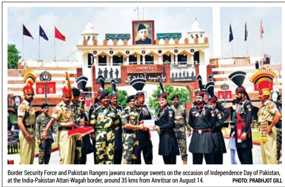
Border Security Force and Pakistan Rangers jawans exchange sweets on the occasion of Independence Day of Pakistan, at the India-Pakistan Attari-Wagah border, around 35 kms from Amritsar on August 14.

at Whistling Woods were very pumped up when I first read out a couplet from the song." The veteran director further talks about the hard work and contribution by the students of his institute Whistling Woods International. "It is an enriching experience to compose and to write a song for your motherland. They encouraged me to compose it. We, thus, decided on celebrating the country's 75th year of Independence in a spectacular, musical way."