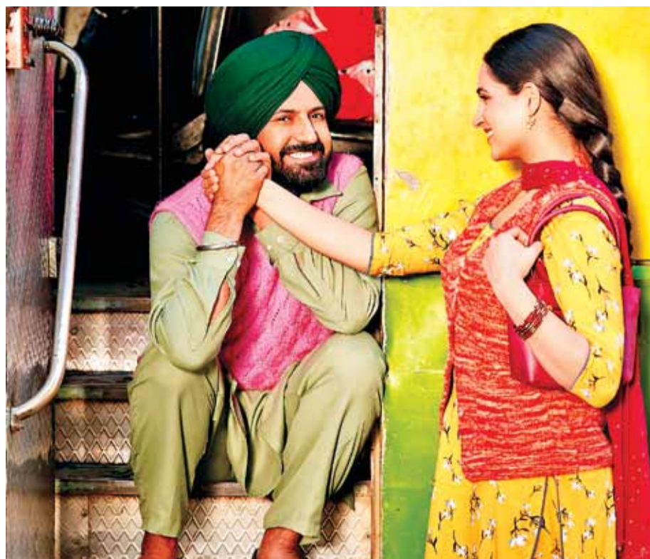
ence something refreshing to watch. It's the perfect film to go watch with your families as it's a laughter riot! You will definitely laugh your hearts out.

Humble Motion Pictures in association with Omjee Star Studios have released their much awaited comedy-drama film 'Yaar Mera Titliaan Warga' on 02nd September, 2022.