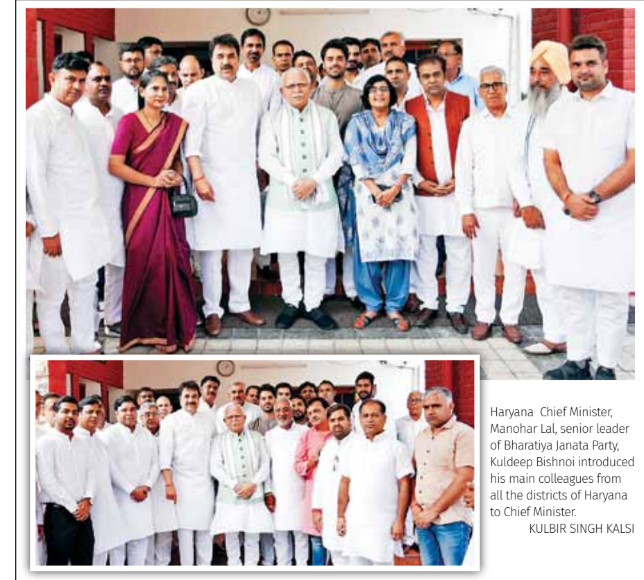
Haryana Chief Minister, Manohar Lal, senior leader of Bharatiya Janata Party, Kuldeep Bishnoi introduced his main colleagues from all the districts of Haryana to Chief Minister.

have proved beneficial bringing desired results when police reaches at the spot of any unwanted happening within minutes and provide assistance to suffering victims promptly and this service have proved helpful in arresting crimes to large extent. Vij said, Anti-narcotic Cell to control smuggling and sale of drugs has been constituted in the state providing satisfactory results and holding several seminars in educational institutes and public rallies to save people from drug addiction, especially youths.