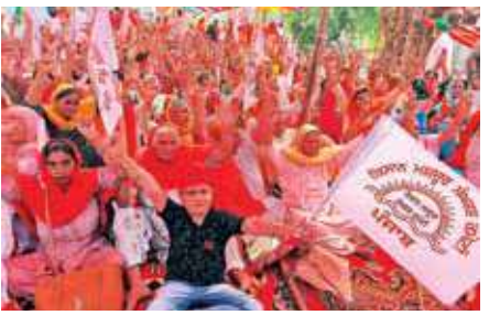
Farmers shout slogans against the central and state governments while blocking railway tracks during a demonstration to show their objection towards the Electricity Amendment Bill on the outskirts of Amritsai