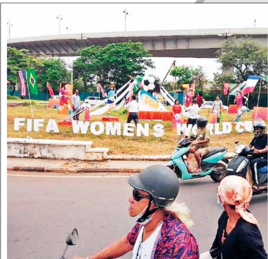
The Panjim roundabout in Goa highlights the FIFA WOMEN'S WORLD CUP 2022 which is set to begin from October 10 and showcase football talent at its best.

Previously, Ayan Mukerji's "Brahmastra Part One: Shiva" offered the film's tickets at Rs 100 during the Navratri festival, days after the National Cinema Day, when tickets for every movie were available at a "celebratory admission price" of Rs 75 at over 4,000 screens across the country.