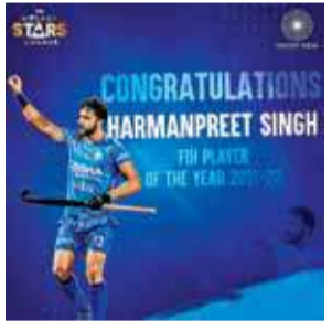
To add to that impressive resume, he has now been voted the FIH Player of the Year, for the second year running. Harmanpreet's total points tally stood at 29.4 points, followed by Thierry Brinkmann with 23.6 points and Tom Boon with 23.4 points. The India vice-captain has scored an incredible 18 goals from 16 games, with two hat-tricks, in the FIH Hockey Pro League 2021-22.

India defender Harmanpreet Singh was on Friday named the FIH Player of the Year in the men's category for the second successive time. The 26-year-old became just the fourth player to win the Player of the Year award (men's category) in consecutive years, joining an elite list that includes Teun De Nooijer (Netherlands), Jamie Dwyer (Australia) and Arthur van Doren (Belgium).