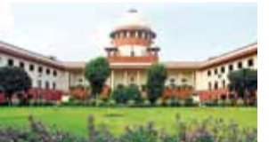
was serving and therefore not eligible for appointment on compassionate ground. "After a period of 24 years from the death of the deceased employee, the respondent shall not be entitled to the appointment on compassionate ground," the bench said. According to the law laid down by the apex court on appointment on compassionate ground, equal opportunity for all government vacancies should be provided to all aspirants as mandated under Articles 14 and 16 of the Constitution. Article 14 of the Constitu-