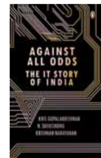
Against All Odds: The IT Story of India By Kris Gopalakrishnan Penguin Random House India 320 pages, Rs 799

"Against All Odds" has been endorsed by the biggies of the