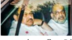
constructed state office at Belto-la, and also address a rally of party workers at the Khanapara Veterinary Ground. Nadda will then depart from the state, while Shah will proceed to hold a meeting on narcotics with the chief ministers, chief secretaries and director-generals of police of Northeastern states. He will also chair a review meeting on the North Eastern Space Application Centre (NESAC) on Saturday evening. Shah will offer prayers at Kamakhya Temple on Sunday morning, and address the plenary session of the North East Council (NEC) at the Administrative Staff College.