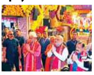
on the concluding day of the nine-day Navratra celebrations, officials said. Before visiting the shrine,

JAMMU: Union Home Minister Amit Shah on Tuesday visited the famous Mata Vaishno Devi shrine atop Trikuta hills in Jammu and Kashmir's Reasi district on Maha Navami festival and offered his prayers. Accompanied by Lt Governor Manoj Sinha and Union Minister Jitendra Singh, the Home Minister arrived at Sanji Chhat by helicopter to pay his obeisance at the shrine