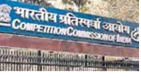
Digital Association had alleged that its members are forced to provide their news content to Google in order to prioritise their weblinks in the Search Engine Result Page (SERP) of Google. As a result, Google free rides on the content of the members without giving

them adequate compensation, as per the complaint. Among others, it was alleged that Google exploited the dependency of the members on the search engine offered by Google for referral-traffic to build services such as Google News, Google Discover and Google Accelerated Mobile Pages (AMP). The search engine major provides news content to user through Google Search and through news aggregator vertical, Google News.