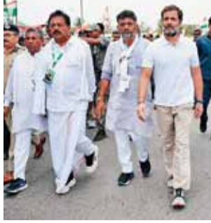
vakumar were also part of the convoy that walked alongside the Gandhis. The happy images of the mother and son walking together filled social media spaces.

Making a public appearance after a long gap, Congress president Sonia Gandhi on Thursday joined the Bharat Jodo Yatra in Karnataka with her presence at the march being viewed in party circles as a major morale booster. Amid loud cheers and slogan-eering by party workers, Sonia Gandhi, 75, walked besides her son Rahul Gandhi and other senior Congress leaders for a few kilometres in Mandya district of Karnataka on Thursday morning. The top party brass of poll-bound Karnataka led by former chief minister Siddaramaiah and state unit chief D K Shi-