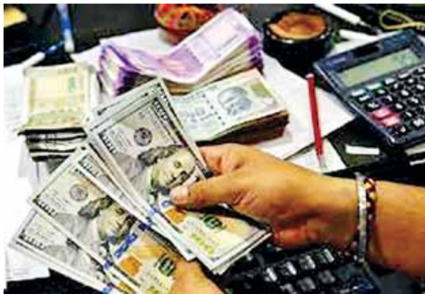
On Thursday, the Indian currency for the first time closed below the 82 level against the greenback. It

At the interbank foreign exchange, the rupee opened at 82.19 against the greenback, then fell to 82.33, registering a fall of 16 paise over its previous close.