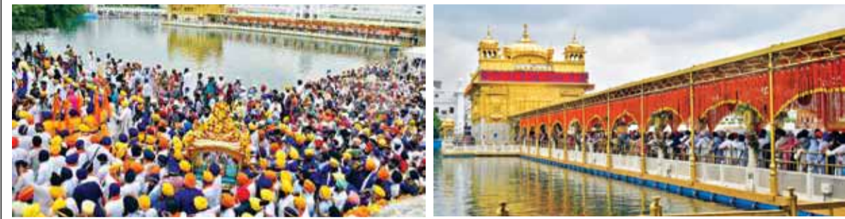
Sikh devotees carry the Palki Sahib with the Guru Granth Sahib, during a religious procession on the eve of 488th birth anniversary of the fourth Sikh Guru Ramdas, at the Sri Harmandir Sahib (Golden Temple) in Amritsar on Monday.