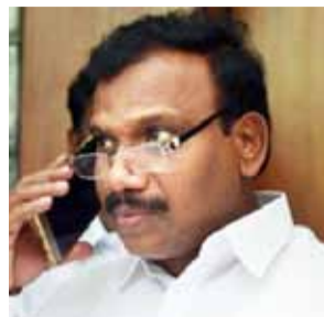
real estate firm.

In the charge sheet filed in August this year, the CBI has alleged that the company had not "undertaken any other real estate activity" other than the purported land deal for the