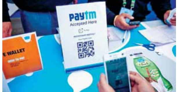
continues to witness accelerated growth with disbursements through our platform now at an annualised run rate of Rs

NEW DELHI: Digital financial services firm One97 Communications, which operates under the Paytm brand name, on Monday posted around 17 per cent increase in annualised run rate of loan disbursements to around Rs 34,000 crore in September.