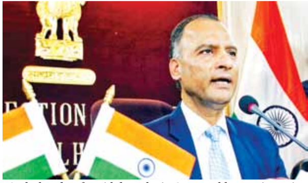
16. The last date for withdrawal of candidature is November 19, "Delhi State Election Commissioner Vijay Dev said. "The MCD has jurisdiction

"The notification for the civic body poll will be issued on November 7. The last day for filing the nomination is November 14 and the scrutiny of the nomination will be held on November