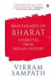
Bravehearts of Bharat: Vignettes from Indian History By Vikram Sampath Penguin Viking; 512 pages; Rs799

In due course, Lachit also held various positions like Ghora Ba-