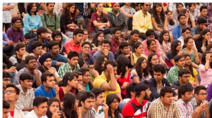
The first 10 hobbies that emerged, in order of preference for engineering youth include - learning new things, watching online documentaries, traveling, reading, gardening, painting, cycling, cooking, online games, and photography...

Google is a company with lots of young employees and a positive thinking envi-