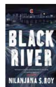
Black River By Nilanjana Roy Context 330 pages; Rs799

At the police station house whose jurisdiction extends to Teetarapur and the neighbouring villages, sub-inspector Ombir