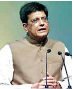
FW DESK New Delhi

Union Minister of Textiles, Consumer Affairs, Food and Public Distribution and Commerce and Industry, Piyush Goyal said that India was confident of achieving textile export target of USD 100 billion by 2030. He was interacting with media persons during the two-day 'Kashi Tamil Samagam' in Varanasi, Uttar Pradesh today. The Minister announced that a unique, one of its kind exhibition, 'VIRAASAT' will be organized in New Delhi to celebrate 75 handwoven saris of India. He said that in the festival 'My Sari My Pride' handwoven saris ranging from Patola, Banarasi, Paithani, Kanjivaram and others will be exhibited. He added that weavers from across the country will participate in the festival which will start from December 16th at Janpath Haat, New Delhi. Goyal noted the profound connection that Kashi had with Tamil Nadu and said that he is reminded of Dev Deepavali firecrackers burst in Kashi which must have been produced in Sivakasi.