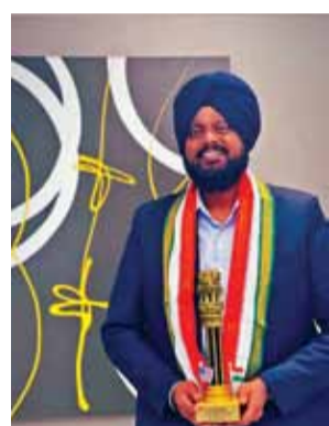
Celebrating the #AzadiKaAmritMahotsav, which showcased the paradigm of Spectacular India at a grand stage representing India's rich diversity and inclusiveness to the world.

The three-day expo organized by GSA India @ 75 Expo showcased India's 75 years of multi-dimensional progress and its rich tradition, alongside