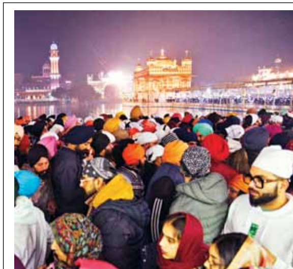
Sikh devotees arrive to pay obeisance at the Harmandir Sahib (Golden Temple), the holiest of Sikh shrines, on New Year's Day in Amritsar on Sunday. Thousands of Sikh devotees stand in a queue to pay obeisance on the first day of 2023.