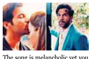
The song is melancholic yet you