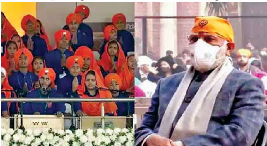
Veer Bal Diwas, we recall the courage of the Sahibzadas and Mata Gujri Ji. We also remember

On the historic occasion, the Centre has organised an interactive and participative programmes all over the country to inform and educate the citizens, especially the young children, about the story of exemplary courage of the Sahibzadas. Prime Minister tweeted, "On