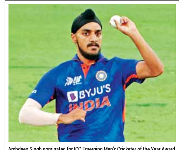
Arshdeep Singh nominated for ICC Emerging Men's Cricketer of the Year Award

batch, the highest package for engineering stood at 64 lakhs. Despite a difficult market scenario, the 2022 highest package marks a 50% increase from the previous year's highest of Rs 42 lakh. Setting yet another benchmark; 8400+ offers are extended to students of various programs of the 2022 batch, where 5000+ offers are extended by Fortune 500 companies. LPU students leveraged an unbeatable placement support system at the university and bagged dream packages in the world's leading companies.