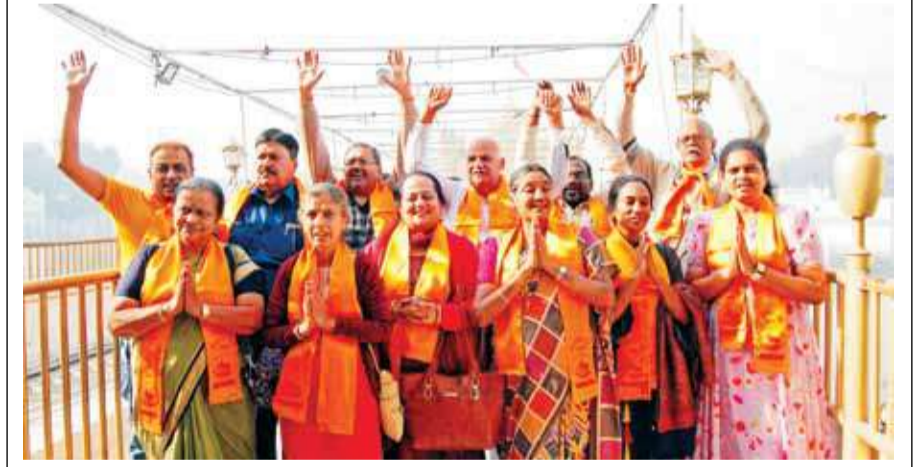
Hindu pilgrims raise slogans before leaving for the Katas Raj Temple in Pakistan to celebrate the upcoming Maha Shivratri festival at the Durgiana Temple in Amritsar on Thursday.