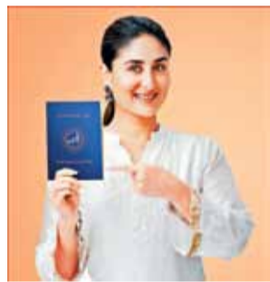
FW DESK New Delhi

GlaxoSmithKline Pharmaceuticals Limited announced that the acclaimed actress and mother of two, Kareena Kapoor Khan will be the face of their latest digital campaign, "Faisla Sahi, Zindagi Sahi". Through this campaign, GSK calls on parents to comply with the vaccination card for their children as recommended by their paediatrician, not only through infancy, but also 1 year and beyond. In the digital films, Kareena talks about the 'moments' a child may miss because of 'missed vaccination'.