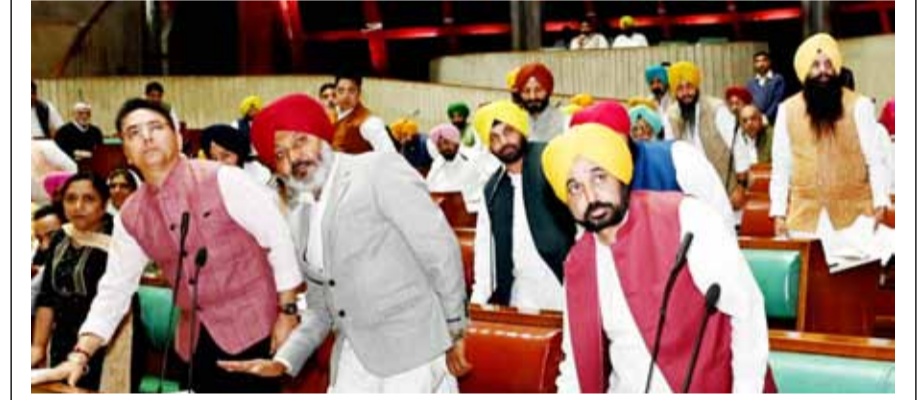
Punjab Chief Minister Bhagwant Mann during the first day of the Budget session of Punjab Vidhan Sabha, in Chandigarh on Friday.