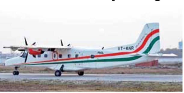
availability of pilot pool for the aircraft and reduced operational cost. In addition, the new variant will result in reduced training requirement for flying and ground crew including aircraft maintenance engineers, HAL said.

5695 kgs with 19 passenger capability, statement said. With this modification, the aircraft would fall in the Sub 5700 kg aircraft category. This variant provides several operational benefits for operators such as reduced pilot qualification requirement enabling pilots with Commercial Pilot License to fly the aircraft, enhanced