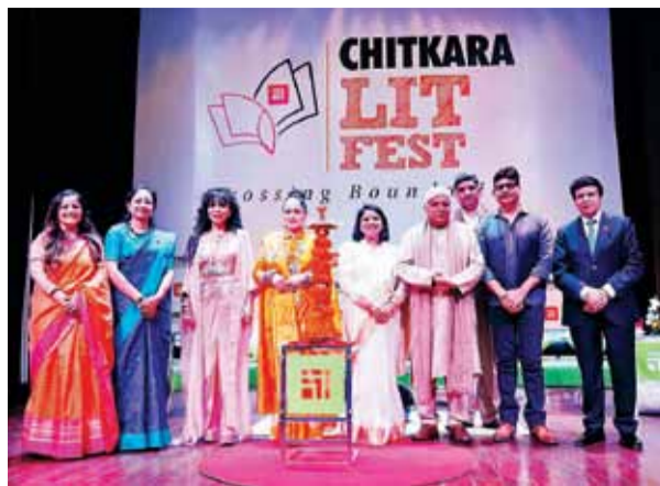
WITNESSES PARTICIPATION FROM A STELLAR CAST OF LYRICAL GREATS AND ARTISTS LIKE JAVED AKHTAR, IRSHAD KAMIL AND USHA UTHUP