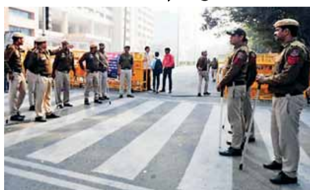
during the day.

NEW DELHI: In view of the protest called by AAP after the arrest of Deputy Chief Minister Manish Sisodia by the CBI, the heavy police deployment was witnessed outside the headquarters of Aam Aadmi Party (AAP) on Deen Dayal Upadhyay Marg in central Delhi on Monday morning.