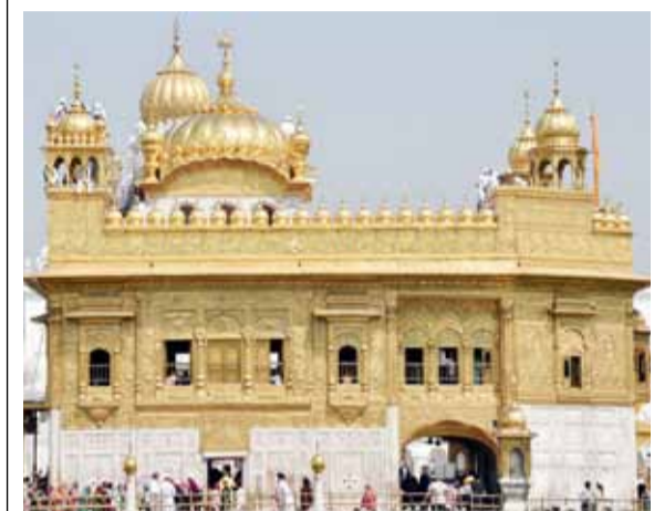
Volunteers of Guru Nanak Nishkam Sewak Jatha from Birmingham (UK) clean the gold plating of the Sri Harmandir Sahib Sikh Shrine in Amritsar on Friday. About 50 volunteers are taking part in the service of cleaning the golden domes and gold plates. The voluntary service is performed by Guru Nanak Nishkam Sewak Jatha every year.