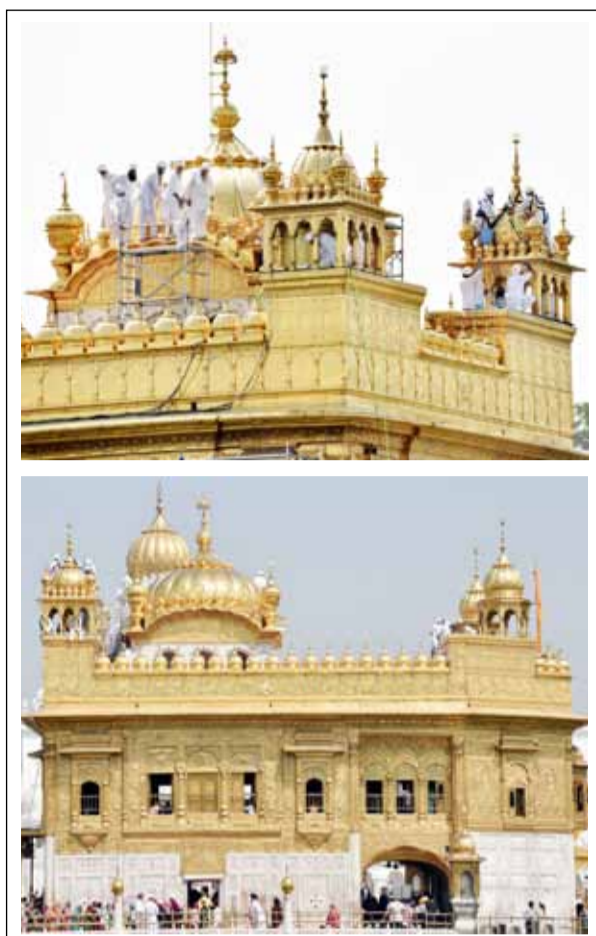
Volunteers of Guru Nanak Nishkam Sewak Jatha from Birmingham (UK) clean the gold plating of the Sri Harmandir Sahib Sikh Shrine in Amritsar on Friday. About 50 volunteers are taking part in the service of cleaning the golden domes and gold plates. The voluntary service is performed by Guru Nanak Nishkam Sewak Jatha every year.

McConnell has held the Senate seat from Kentucky since 1985.