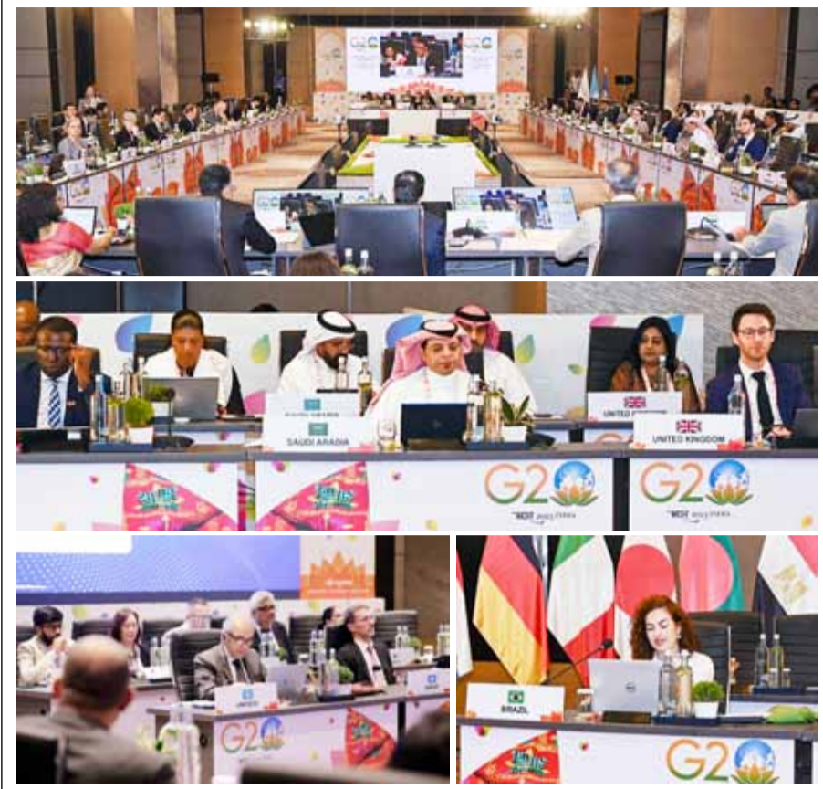
Delegates attend the second day of the 2nd G-20 Education Working Group meeting in Amritsar on Thursday.

Indians in Australia said they are "angry, scared and dismayed by the blatant display of religious hatred towards the peaceful Hindu community by Khalistan supporters".