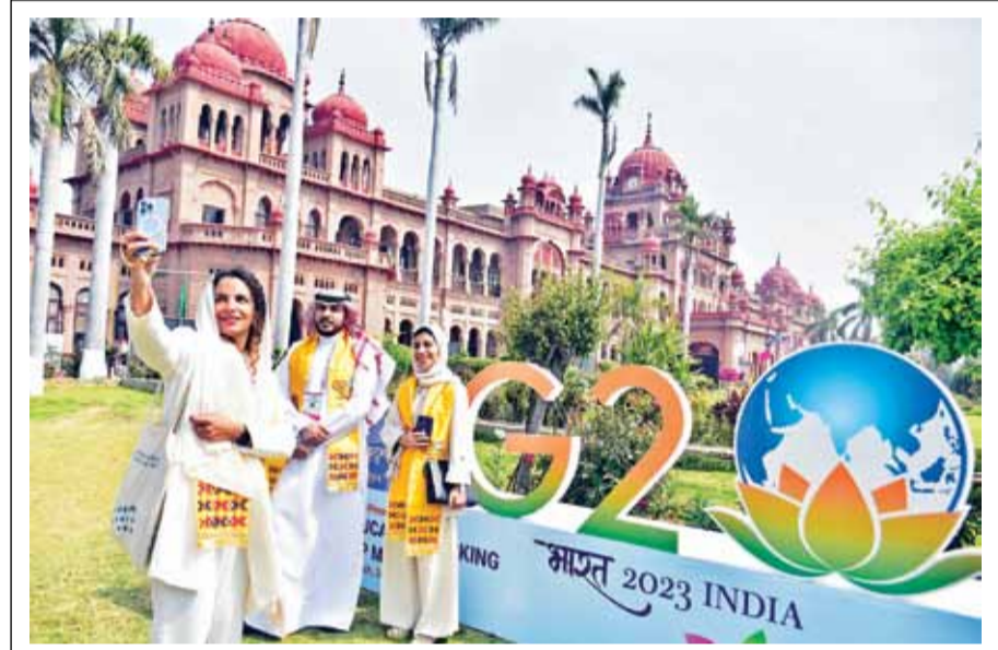
G-20 summit delegates clicking selfies with newly unveiled G-20 logo during the second G20 Education Working Group meeting at Khalsa college in Amritsar on Wednesday