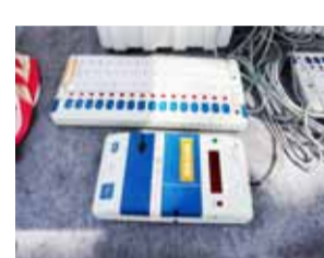
Govt. of India) and Electronic Corporation of India Limited (M/s. ECIL) (PSU under the Department of Atomic Energy, Govt. of India). Paper Roll of

The Election Commission of India (ECI) has informed that EVMs and VVPATs are designed and manufactured indigenously by Bharat Electronic Limited (M/s. BEL) (PSU under the Ministry of Defence,