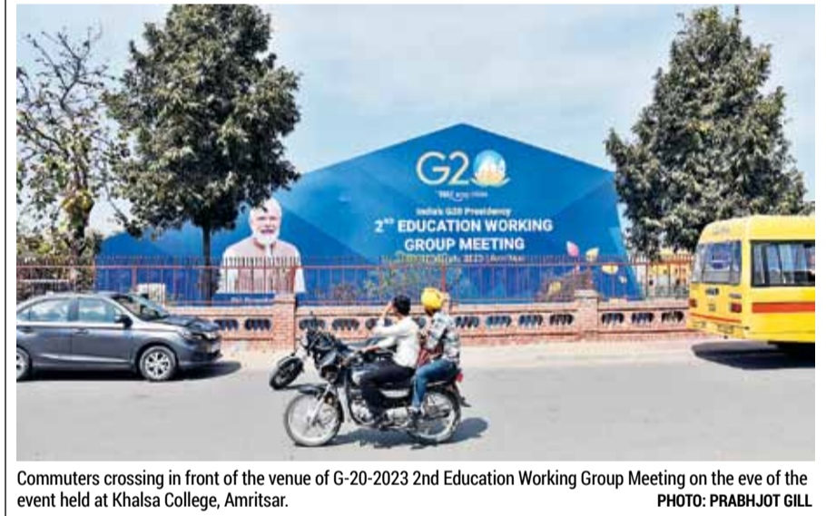
Commuters crossing in front of the venue of G-20-2023 2nd Education Working Group Meeting on the eve of the event held at Khalsa College, Amritsar.

got engaged at the Taj Mahal in Agra, and confirmed it on social media. However, the source concluded that they are respectful towards each other, good friends and are there for each other.