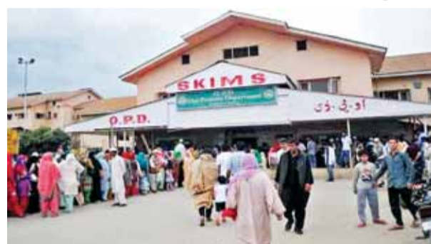
Srinagar hospital. Sopore town, once a militant stronghold, has been peaceful over the last several years. Police has launched the investigation into the case.

He was immediately shifted to a nearby health facility, where he was referred to a