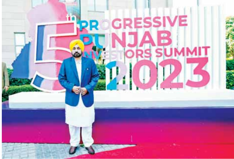
Punjab Chief Minister Bhagwant Mann Inaugurates a hi-tech exhibition during the fifth Progressive Punjab Investors Summit 2023 at Mohali on Thursday.

Myntra, which has more than 1400 brands and more than 75,000 products, has always found its strength in the beauty and personal care category and with the latest association the brand aims to upscale its offering and market cap.