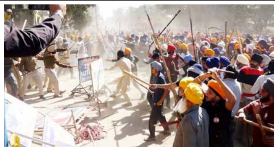
Clash between Supporters of 'Waris Punjab De' Chief Amritpal Singh and Punjab Police personnel as they headed towards police station in Ajnala to protest the arrest of his aide in a kidnap and assault case at Ajnala, 25km from Amritsar, on Thursday.

The representatives of France institutions were from the Campus France Inde; Alliance Francaise India; AIVANCITY School for Technology, Business & Society; Em Strasbourg Business School; MBway-Management & Business School; ICN Creative Business School; Essec Business School; Devinci Higher Education; Aura International School of Management and more.