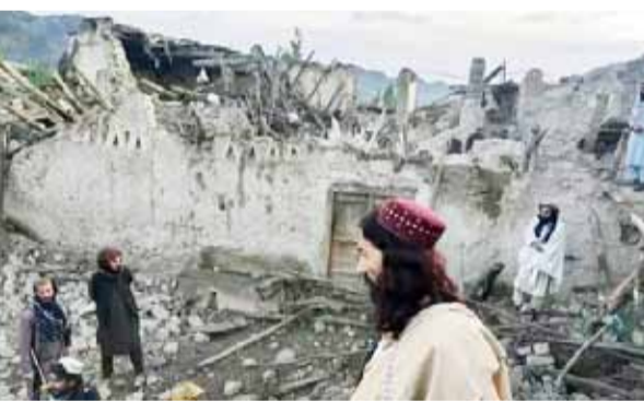
agency AFP that they never felt such tremors in their entire life. The resident was a woman who rushed out of her fifth-storey apartment following the earthquake. At least nine deaths were reported from Pakistan's Khy-

DELHI: The death toll from the earthquake that shook large parts of Pakistan and Afghanistan rose to 20 on Wednesday. The number of injured also rose to over 200. An earthquake of 6.5-magnitude shook and damaged buildings, triggered landslides and sent people running into the streets, BBC Urdu reported. The epicentre of the earthquake was a mountainous region in Afghanistan's north-eastern area which borders Pakistan. The tremor that struck Jurm valley also was felt as far as the Indian capital of New Delhi. A Kabul resident told news