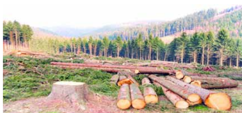
THE FAO'S LATEST REPORT ON STATE OF THE WORLD'S FORESTS (2022) STATES THAT FORESTS COVER 31% OF THE EARTH'S LAND SURFACE BUT THE AREA IS SHRINKING, WITH 420 MILLION HA OF FORESTS LOST DUE TO DEFORESTATION BETWEEN 1990 AND 2020

Climate change is a major threat to forest health and this is manifested in a number of ways. For instance, there are indications that the incidence and severity of forest fires and pests are increasing. The COVID-19 pandemic also had a significant impact on