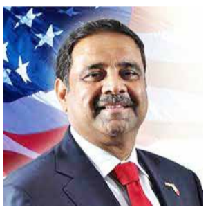
Development and Investments, and Owner of DG Hospitality. He is the immediate past