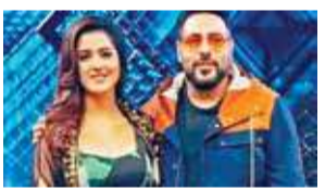
is planning a Gurdwara wedding