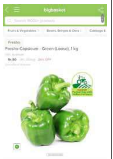
The picture from Mansa(Punjab), where farmers threw capsicum on the road as a protest when they have to sell capsicum in Mandi at Rs1 per Kg. On the other hand see the rate in Bigbasket @ Rs.80/- per kg.