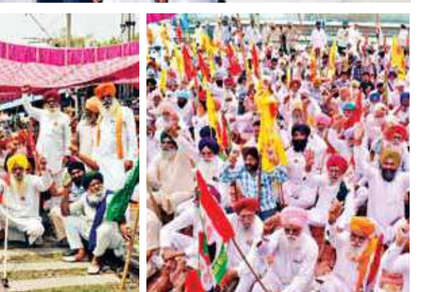
Farmers shout slogans against the central and Punjab state governments while blocking railway tracks during a demonstration against the price of damaged grains due to rains, at a railway station in Amritsar on Tuesday.