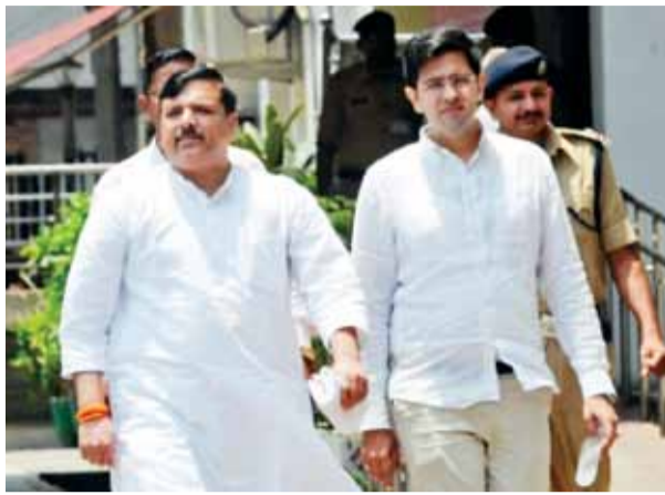
residence in connection with the liquor policy case.