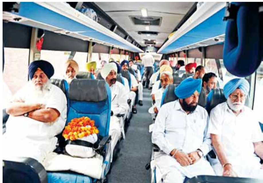
SUKHBIR SINGH BADAL CARRYING ASHES OF HIS FATHER AND FORMER PUNJAB CHIEF MINISTER PARKASH SINGH BADAL LEAVES FOR SHRI KIRATPUR SAHIB GURUDWARA, AT BADAL VILLAGE IN SRI MUKTSAR SAHIB DISTRICT ON WEDNESDAY. SUKHBIR SINGH BADAL AND MP HARSIMRAT KAUR BADAL IMMERSE ASHES OF HIS FATHER AND FORMER PUNJAB CHIEF MINISTER PARKASH SINGH BADAL IN SUTLEJ RIVER, AT KIRATPUR SAHIB IN RUPNAGAR DISTRICT ON WEDNESDAY. UNION HOME MINISTER AMIT SHAH PAYS HIS LAST RESPECTS TO FORMER PUNJAB CHIEF MINISTER AND SHIROMANI AKALI DAL PATRON PARKASH SINGH BADAL DURING HIS 'ANTIM ARDAS' AND 'BHOG' CEREMONY, AT BADAL VILLAGE IN SRI MUKTSAR SAHIB DISTRICT ON THURSDAY. SHIROMANI AKALI DAL (BADAL) PARTY LEADERS AND WORKERS OFFER PRAYERS DURING HIS 'ANTIM ARDAS' AND 'BHOG' CEREMONY, AT BADAL VILLAGE IN SRI MUKTSAR SAHIB DISTRICT ON THURSDAY.