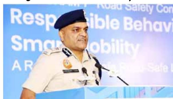
FW DESK New Delhi