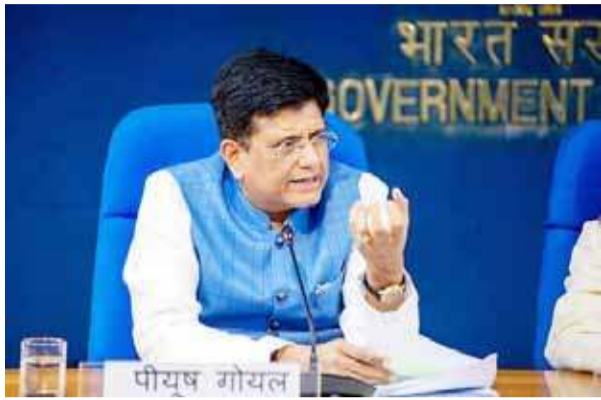
with the industry and demand assessment are critical to identify high value & high-volume potential products to

NEW DELHI: The Ministry of Textiles on Thursday gave approval to 20 Research & Development (R&D) projects worth Rs 61.09 crore which includes key strategic areas such as Geotech, Protech, Indutech, Sustainable Textiles, Sportech and Buildtech segments. The allocation was announced after Union Minister for Textiles Piyush Goyal held the 6th Mission Steering Group (MSG) meeting of the National Technical Textiles Mission on Thursday. He said that international benchmarking, deliberations