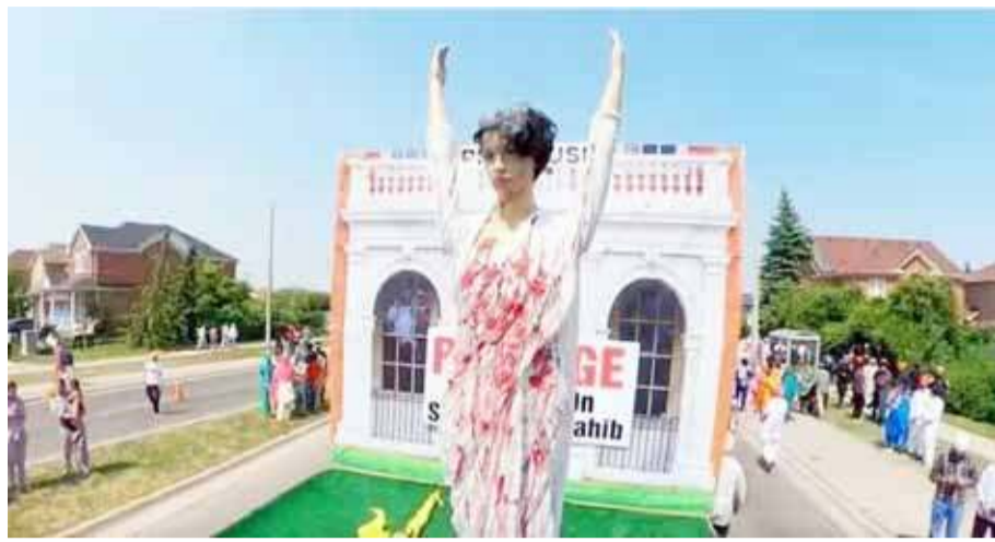
listan flags with a poster that said "revenge". People in Punjab were

His reaction came after social media was abuzz with videos depicting a tableau depicting the assassination of the late Prime Minister by her Sikh bodyguards as part of a five-km-long parade by the Indian diaspora in Brampton on June 4.