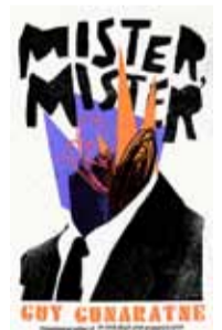
Mister, Mister By Guy Gunaratne, Tinder Press; 384 pages; Rs 899

colonial legacy's deception and the subsequent search for identity and redemption. Gunaratne's annotated chapters read like a performance, with the author assuming the role of a master puppeteer, manipulating characters and teasingly pointing at the audience, exposing the hypocrisy of a corrupt and decadent society. His talent lies in captivating readers, much like the great Charles Dickens, by throwing minted chocolates amidst the haunted urchins and Jihadi Johns lurking in the shadows. "Mister Mister" is a tragic exploration of displacement on a global scale, its reverberations felt within our own communities. The "other," historically defined through the