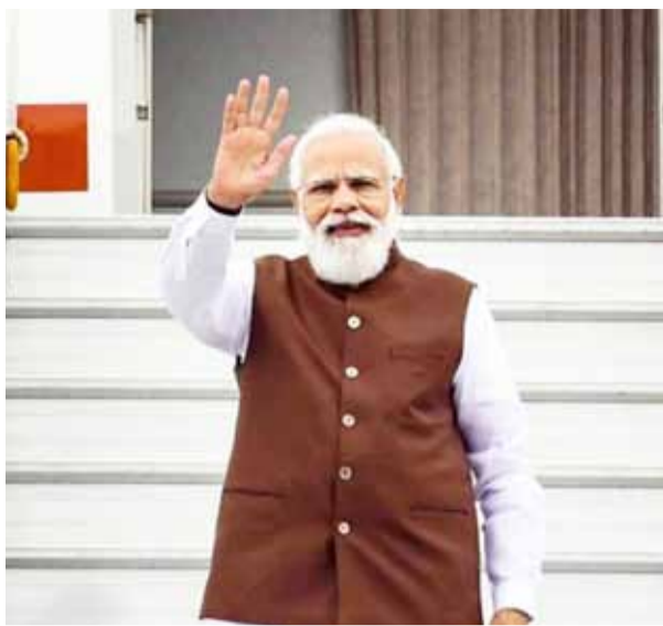
external affairs ministry said.

Modi will thereafter travel to Washington D.C., where he will receive a ceremonial welcome at the White House on June 22, and meet President Biden to continue their high-level dialogue, according to a statement issued by the