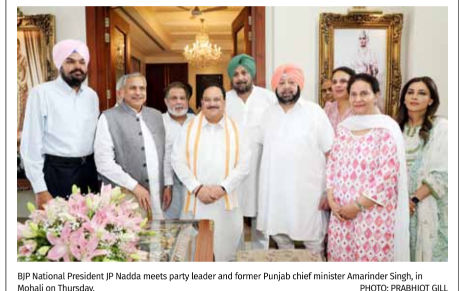
BJP National President JP Nadda meets party leader and former Punjab chief minister Amarinder Singh, in Mohali on Thursday.

University area, sprinkled red chillies in his eyes and attacked with sharp edged weapon on his arm and snatched a bag containing Rs. 10 lac cash and fled away. Police said that an investigation was underway, CCTV cameras of nearby areas were being checked to find out the clue. Presently the victim was hospitalized for his eye treatment as red chilly was thrown in his eyes by the looters.