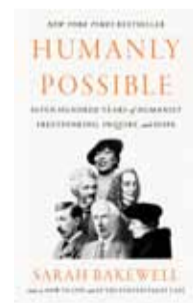
Humanly Possible: Seven Hundred Years of Humanist Freethinking, Inquiry, and Hope By Sarah Bakewell, Penguin, 464 pages, Rs 2,301

Moreover, the book resonates with contemporary concerns, particularly in light of the COVID-19 pandemic, which exposed deep-seated economic inequalities and