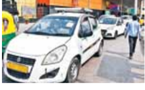
FW CORRESPONDENT New Delhi

In a major relief to thousands of taxi owners across Delhi, the Transport Department has directed that all taxis plying on CNG or other clean fuels and possessing a contract carriage permit will now have their permit validity extended to 15 years.