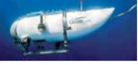
FW DESK New Delhi