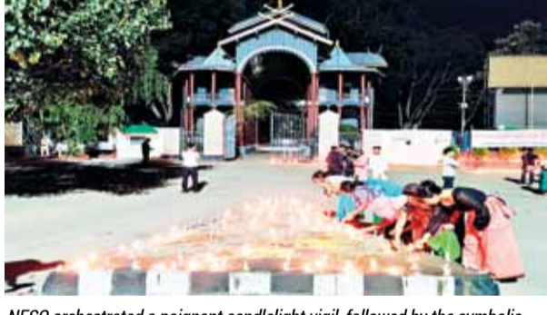
NESO orchestrated a poignant candlelight vigil, followed by the symbolic act of affixing the candles in front of the revered Kangla's western gate on Wednesday evening.

As part of their ongoing efforts, NESO organized a candlelight vigil for peace at the western gate of the iconic Kangla in Imphal. Similar programs were simultaneously held in the capitals of all eight northeastern states. The vigil aimed to bring together the