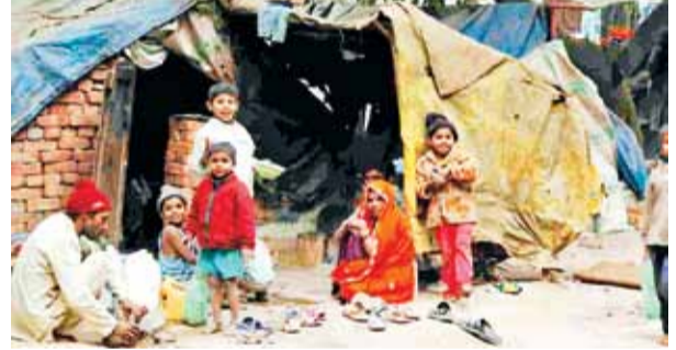
to get treatment in the hospital. During first phase, 30,60,000 families from weaker sections having total number of 1 crore 26 lakh 54 thousand members in these families were examined by health department teams, when it was detected that nearly 55000 persons mostly women were found suffering from Anemia, nearly

Every seventh person from weaker section families in Haryana state during a medical check up under 'Nirog Haryana Yozna' campaign launched in the state, was detected suffering from a health disorder, it was disclosed to media persons by Haryana chief minister Manohar Lal Khattar. He said that health department teams had medically checked nearly 13.77 lakh members of families belonging to weaker sections in the state, of whom nearly 2.13 lakh persons were found suffering from some health disorder and were advised