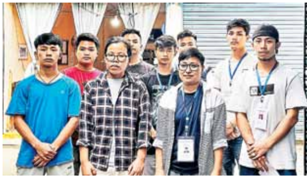
Volunteers of Matai Society, Moirang, operating a Trauma Response Center (TRC), gather for a group photo after sharing their experiences.

The majority of the camp's residents hail from Phayeng, and many of the children arrived without their parents. These young ones are being looked after by volunteers and a handful of guardians who have come from their respective villages to offer their assistance. Most parents made the difficult decision to send their children to the relief camp in order to protect them from the violence.