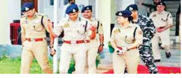
Shopian briefed the ADGP on the modified joint area domination and zero terror plan. At Pulwama, the ADGP held a meeting with the DIG Police, Commanding Officers of

on gathering human intelligence (Humint) and to collaborate with security forces in launching anti-terrorist operations. He emphasized the importance of taking preventive legal measures to curb recruitment into terrorist ranks. Each police officer in the district was assigned to work on different terror modules under the close supervision of the district SSP. The district police chief of