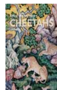
The Story of India's Cheetahs By Divyabhanusinh Marg Books 324 pages; Rs 2,800

classes soon emulated, leading to the cheetah's rapid decline and eventual extinction in India by the 1950s. The author also addresses the recent controversy surrounding the translocation of cheetahs from Africa to India. He argues that African cheetahs have been imported into India since the early 20th century, primarily due to the